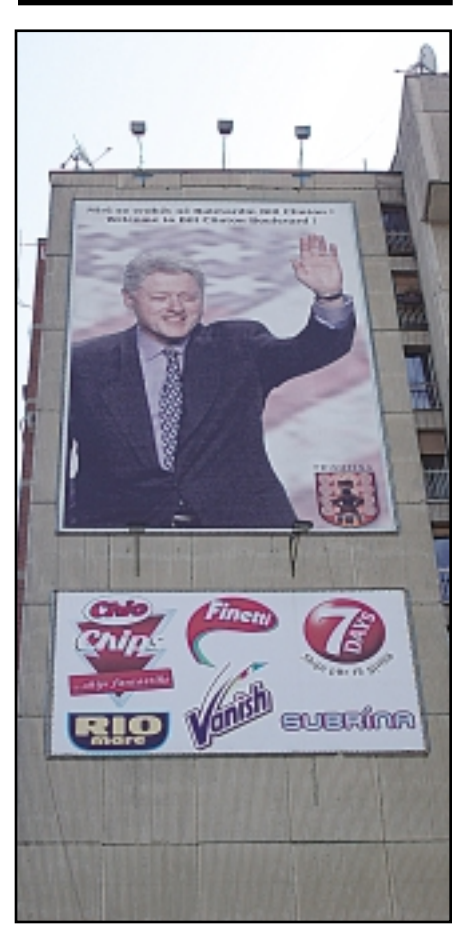
It was during the term of President Clinton when Kosova's future was secured by the deployment of NATO troops. This large billboard welcomes you to Bill Clinton Boulevard, dedicated as a "thank you" to America for saving their country.

eign visitors, the U.N. was not able to proceed in any new Kosova matters or its overall plans due to internal resistance from some of its member states. Ultimately the Kosova issue turned out to be a unique case in which no U.N. process would work, given the specter of veto options being exercised in the Security Council. An immediate breakthrough proved impossible. Alternative avenues had to be considered.