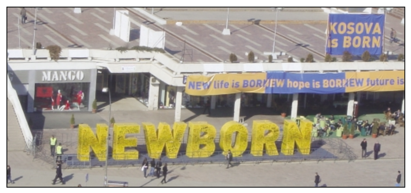
The wording on the sign across from our hotel reads: "KOSOVA IS BORN — New Life is Born, New Hope is Born, New Future is Born, a New Country is Born." You cannot phrase it any better, DX-wise either!

You people are worth our warmest thoughts, not just on our QSL cards.