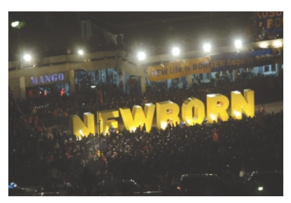
The "Newborn" theme was staring at us through our hotel window, and everywhere in the city. During the course of the festival, people came to sign their names on these tall, illuminated structures.

We had invited several individuals offering valuable resources for the pro-