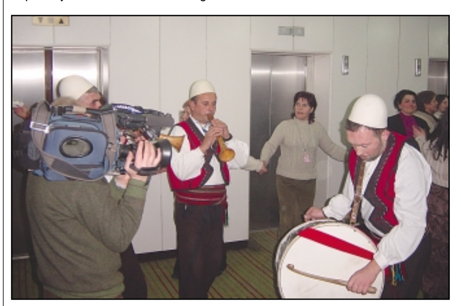
There were parties everywhere after independence was declared, even in the lobby of the Grand Hotel, with plenty of TV crews on hand to capture the moment.

However, clouds were gathering on the horizon, and the United Nations process for a resolution was slow and painful. Even though we had a tentative plan for a 4U (United Nations) callsign block to be released for locals and for-