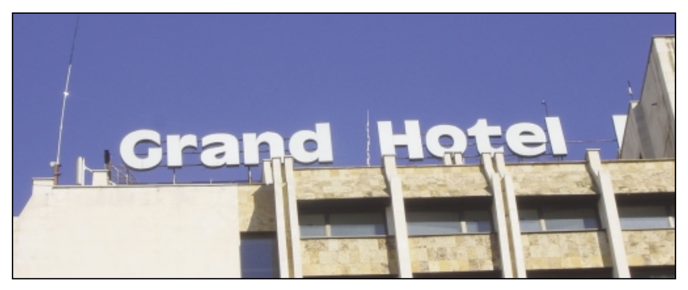
The Grand Hotel was the main base for visiting delegates and the media, and the location of one of two stations set up for the YU8/OH2R operation. Note the pair of SteppIR verticals at the far left and center of the photo.

YU8/OH2R. We participated in the official independence ceremonies, but immediately after YU8/OH2R was on the air from two locations sharing the moment with folks all over the world. Many "happy messages" rolled out and called people for a dance on the radiowaves; some 11,000 radio contacts were handed out in three days. You can look for yours online at <a href="http://df3cb.com/logsearch/yu8/">http://df3cb.com/logsearch/yu8/</a>. A new country had been born, with a slogan featured everywhere in the city: NEWBORN!